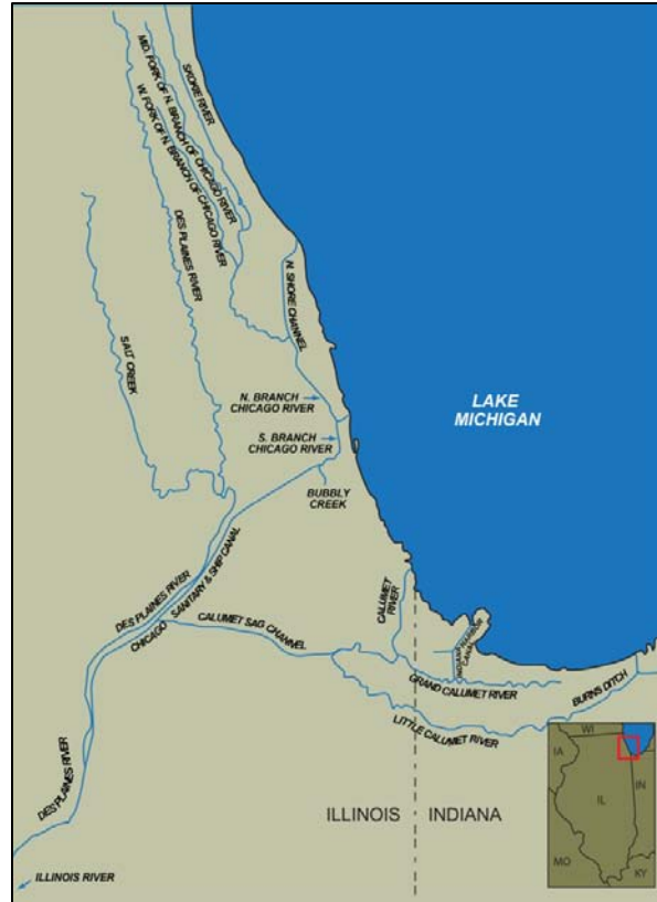
Figure 2: Focus Area I – CAWS and Select Tributaries