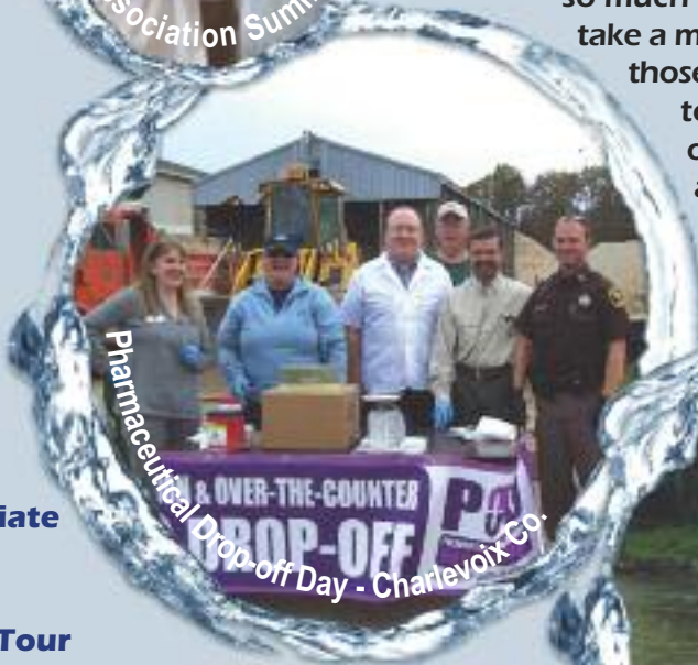
Pharmaceutical Drop-off Day - Charlevoix Co.