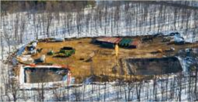
Current hydraulic fracturing site, Petoskey Pioneer #1-3 well, is located in Missaukee County.