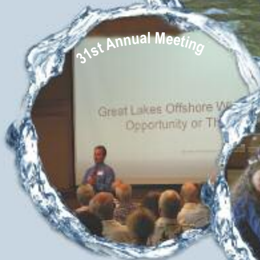
31st Annual Meeting