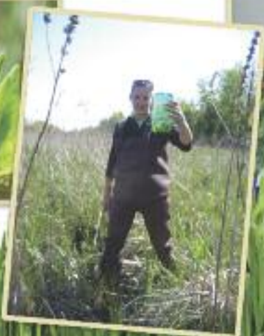
Galerucella beetle feeds on the foliage of a purple loosestrife.