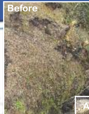
Approximately 35 linear feet on the Pigeon River slumped likely as a result of high water levels in early spring of 2008.

- Mullett Lake Preservation Society (MAPS)