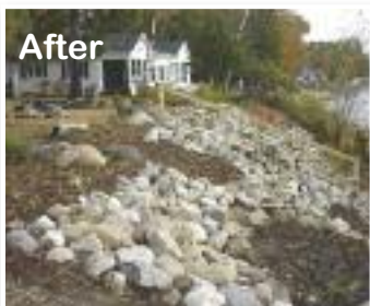
Native planting pockets are incorporated into fieldstone revetment.

Harbor Springs Excavating started by removing the concrete rubble to create a clean slate for New Savanna Landscape Company.