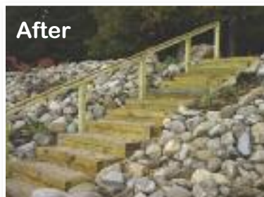
Access to the lake can be gained safely by way of new stairs.