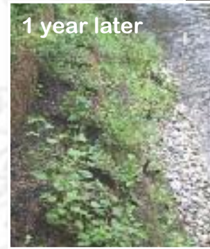
Nearly one year after installation, the shrubs have begun to fill in and the slope remains stable. Over time, the project will become less and less evident as the vegetation grows and the area blends in with the natural riparian areas.