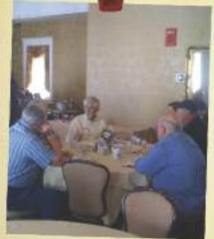
Lake Association Summit Participants gather to discuss what they have learned and share ideas.