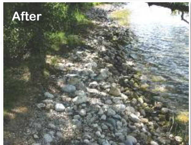
Nearly a year after installing a bioengineering project, the Columbus Beach Club shoreline remains stable and protected.