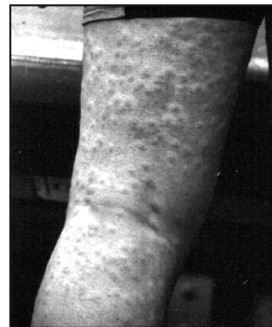
Swimmer's itch (shown above), can be extremely annoying and uncomfortable, but it is not a communicable or fatal condition.

dermatitis (Swimmer's Itch) experience the most severe itching early in the morning. After approximately 24 hours, the reddened areas reach their largest size. The itchy, reddened, and raised areas are often confused with bites from chiggers or mosquitoes and the symptoms may be misdiagnosed as those resulting from poison ivy or stinging nettles. Chigger bites are usually located at points where clothing contacts the skin such as wrists, waist, ankles, etc. Itching is limited to points of cercarial entry and will not spread and will never develop into water blisters.